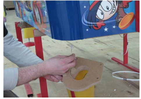
13. Fix together elements of lamp's construction.